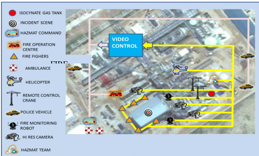
Deployment of various resources

8.46 p.m. Chemical HAZMAT response unit alerted.